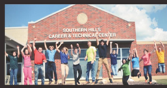
SOUTHERN HILLS CAREER AND TECHNICAL CENTER